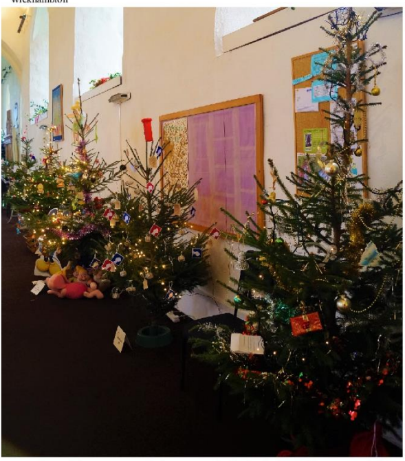
Reedham Christmas Tree Festival 2014 - see inside for details of this year's Festival

Acle: Beighton with Moulton: Freethorpe: Halvergate with Tunstall: Limpenhoe, Southwood and Cantley: Reedham: Wickhampton