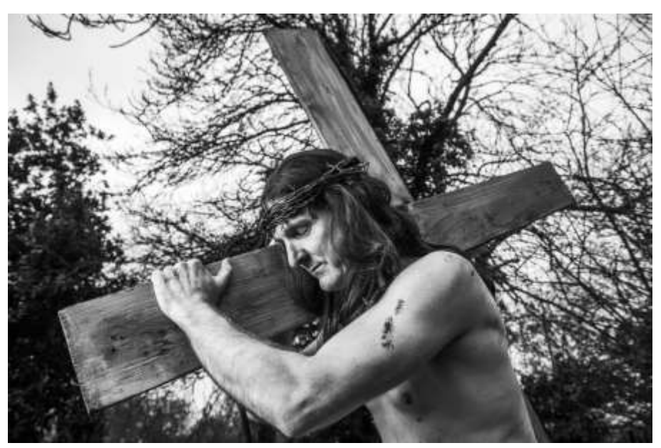
Reedham Passion Play – photo by James Bass Photography.