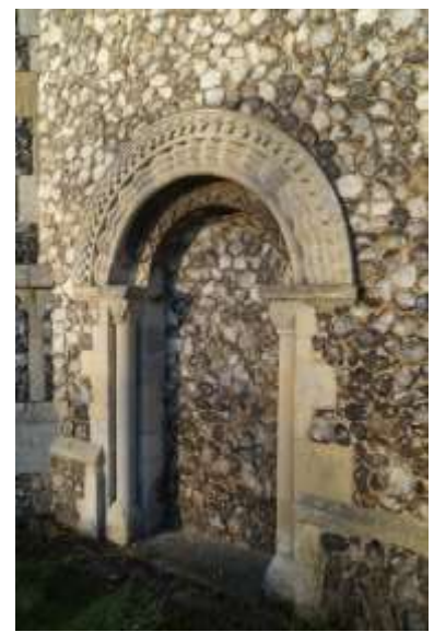
Where is this? – see next Issue.