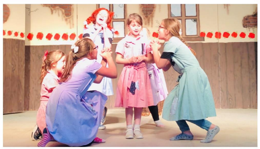
RCA stage school performance of Magic of the Theatre on 26th and 27th July.