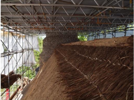
Above and Below - work nearing completion on Beighton church