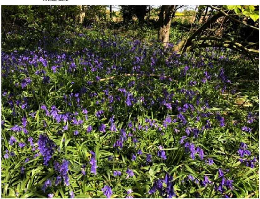
Bluebells at St Edmund's, Southwood - see article

Acle: Beighton with Moulton: Freethorpe: Halvergate with Tunstall: Limpenhoe, Southwood and Cantley: Reedham: Wickhampton