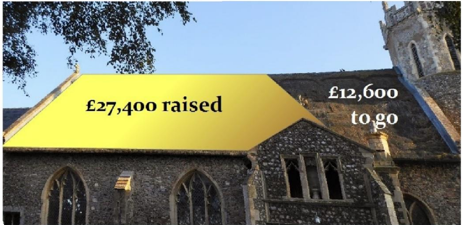
The progress of the Acle Thatch Appeal

The Parish Magazine for the Churches of the Acle & Bure to Yare Benefice and Community Newsletter for Reedham and Area.