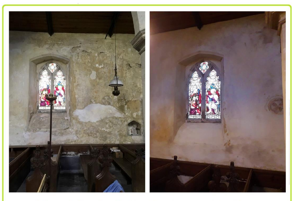
Before and after of the Beighton plastering - see article inside.