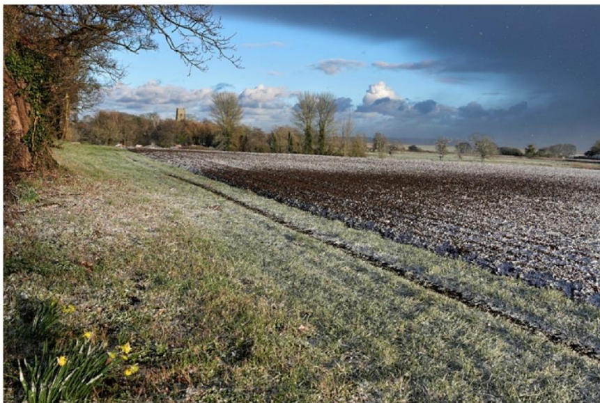
March Snow - looking towards Reedham Church on 10th March.