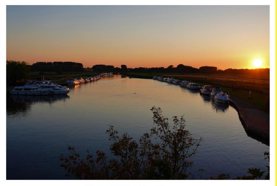
A Summer's evening at Acle Bridge.