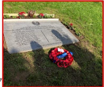
Below: The School also marked Remembrance Day at the Memorial.