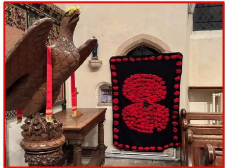
Right: Remembrance ceremony at Moulton St Mary - but we have no idea why the eagle is wearing a bunch of grapes on his beak.