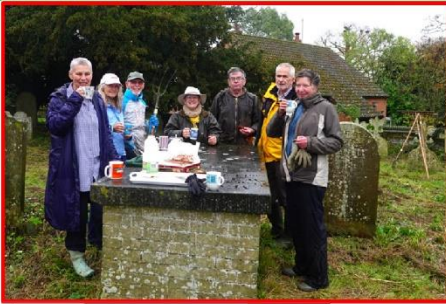
Left: The valiant group warming up after raking Reedham Churchyard in the rain and cold.