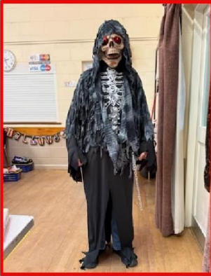
Left: One of the members of Reedham Over Fifties Club at their Halloween party.