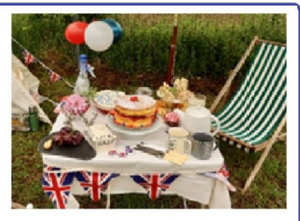
Above: This scrumptious spread won the magnum of champagne as the "Best-dressed" table at Wickhampton's Jubilee picnic!