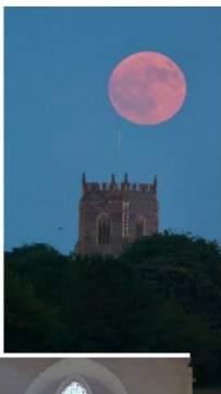
Far Left: Acle Churches Together Prayer Walk.