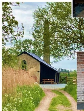
Left and below: The bench at RSPB Strumpshaw in memory of Alan Haycock.