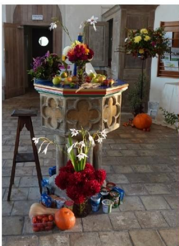
Above: Reedham, Sunday 2nd October