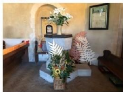
Above: Limpenhoe Festival, Sunday 2nd October