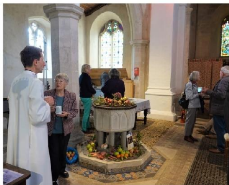
Above: Bighton Festival, Sunday 25th September