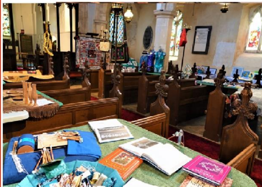
Below: Beighton Crafts Fair on 11 - 12th September