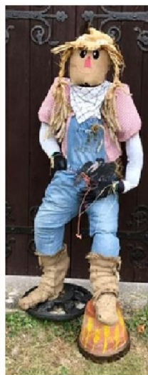
Left: One of the Scarecrows at Wickhampton Scarecrow Festival, 12th September.