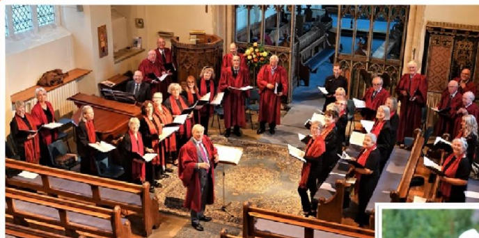
Left: The Benefice Choir about to sing Evensong at Acle Church on 12th Sept.