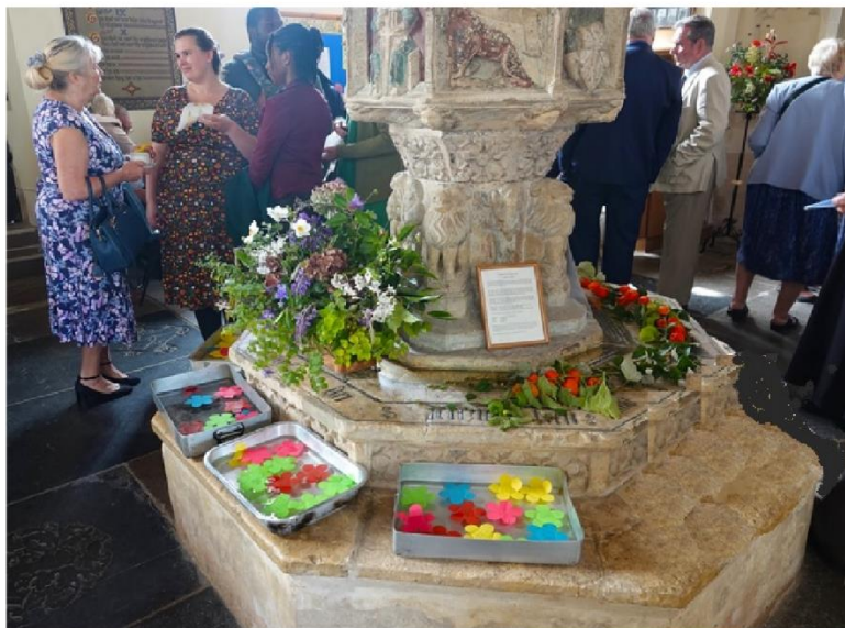
'Celebrating Care' at Acle Church, Sunday 31st August.