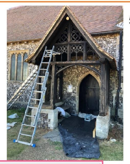
Left: Work starts on Limpenhoe's Church Porch - the 'before' photo.