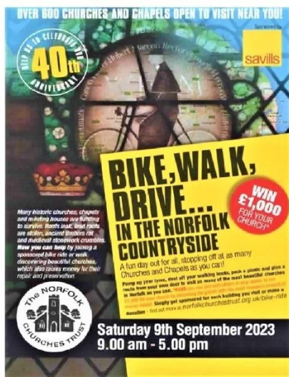
Wickhampton Teddy Bear Day, 13th August