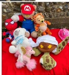
Right: An assortment of soft toys await their turn for the Zip Wire.