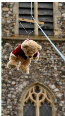
Left: Teddy Bear descends from the tower on the Zip Wire

Coffee/Tea, Cakes, Scones and a Good ol' Mardle Children's area with books, toys, crafts