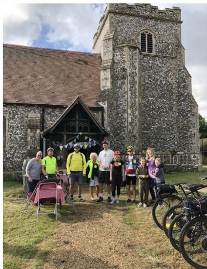
Above: Norfolk Churches Trust cyclists outside Limpenhoe church last year.