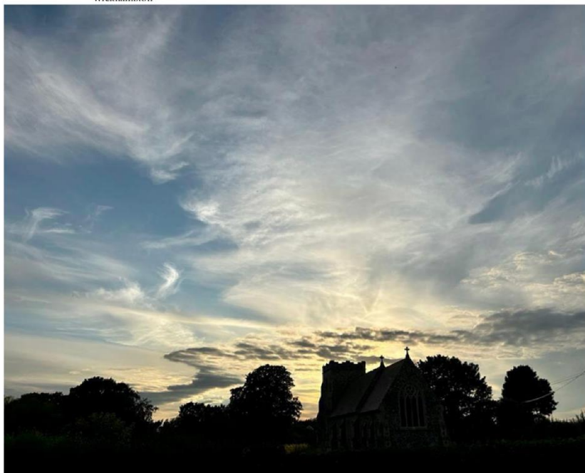
Taken while Champing at Limpenhoe Church